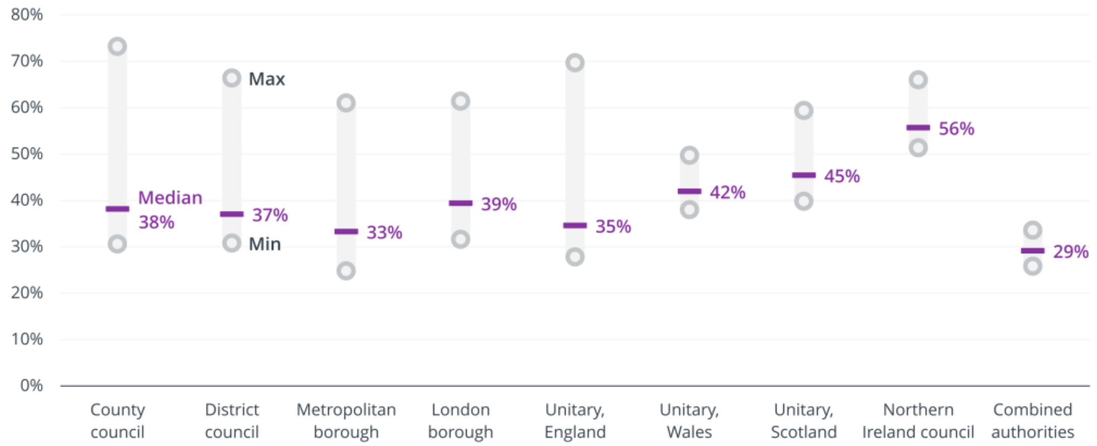
Maximum, minimum and median turnout at sub-national elections, 1990-2022 IfG